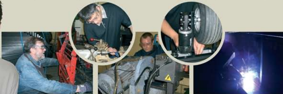
Each Prestige product is well designed, manufactured to the highest quality and tested at each stage to ensure it is the best.