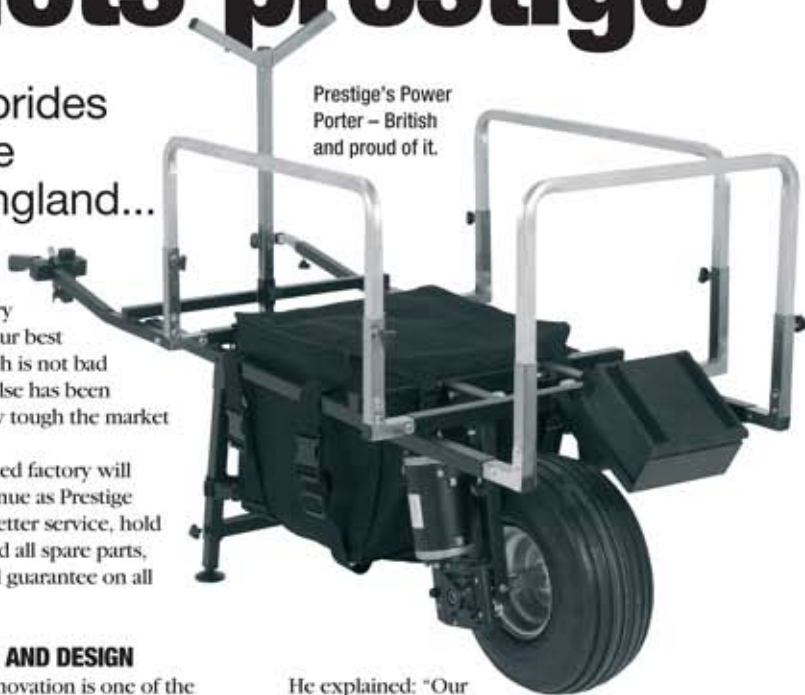
Prestige's Power Porter - British and proud of it.

He explained: "Our long-term aim is to increase our quality and brand awareness. Carp-Porter is already an extremely well-known trademark but there is a market for cheaper Far Eastern products, using cheap labour and putting our own managers in place there. We aim to be leaders in our field and have already made inroads into this.